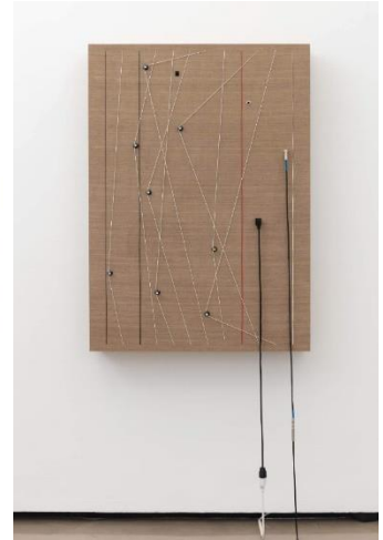
Naama Tsabar Transition , 2017